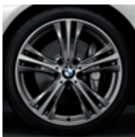
19" Star-spoke style 407