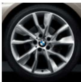
19" Turbine style 402