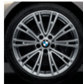
19" BMW Individual V-spoke style 626 I