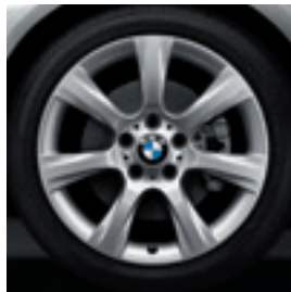
18" Star-spoke style 396