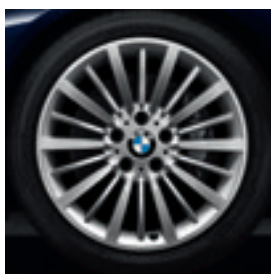
18" Multi-spoke style 416