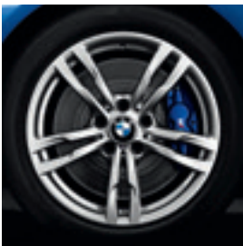
18" M Double-spoke style 441 M