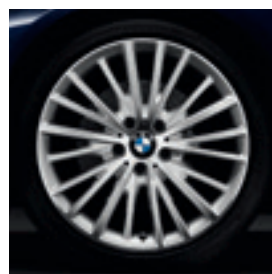
19" Multi-spoke style 399