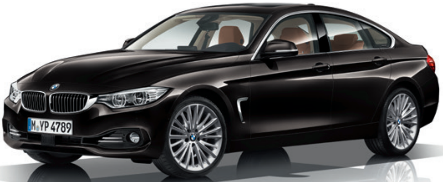
Luxury model shown above with optional Multi-spoke style 399 wheels.

RRP from £31,000 inc. VAT + £2,500 over SE