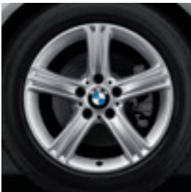
17" Star-spoke style 393