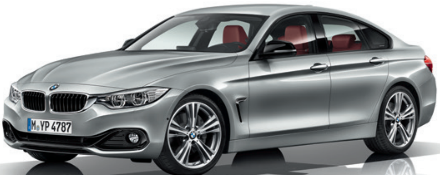
Sport model shown above with optional Star-spoke style 407 wheels.

RRP from £30,000 inc. VAT + £1,500 over SE