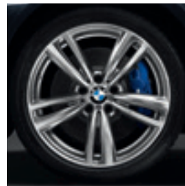
19" M Double-spoke style 442 M