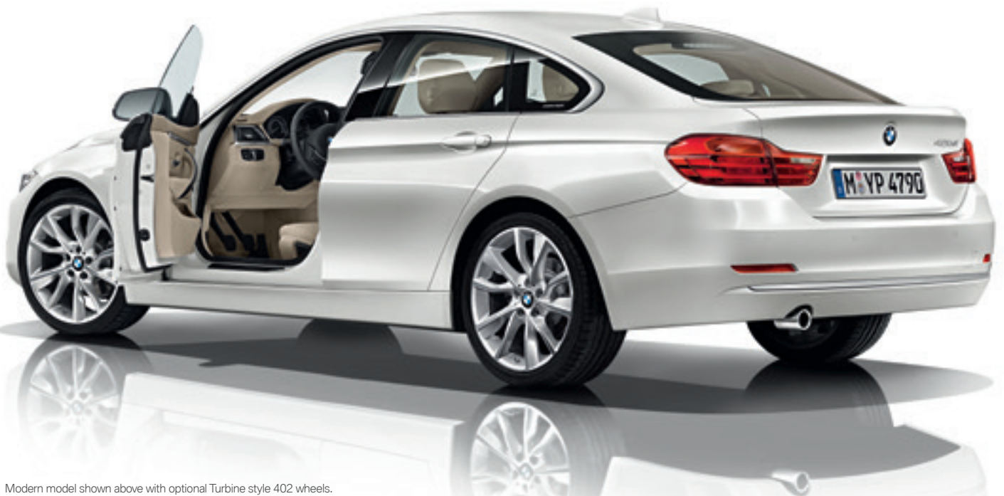
Modern model shown above with optional Turbine style 402 wheels.

RRP from £30,000 inc. VAT + £1,500 over SE