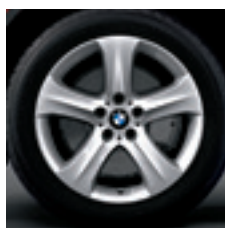
19" Star-spoke style 258