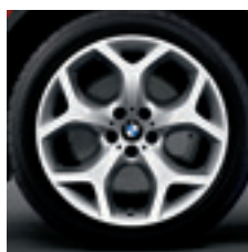
20" Y-spoke style 214