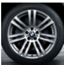
20" M Double-spoke style 333 M