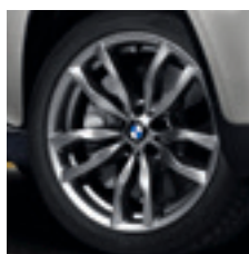
20" M Double-spoke style 435 M

Key ● = Standard ○ = Optional - = Not available Only with = these options must be ordered together Not with = these options are not available for ordering together BMW Winter Tyre Packages available on the BMW X6. Please contact your local BMW Dealer for more information.