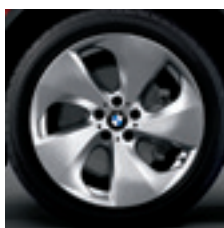
20" Streamline style 297