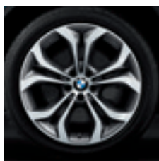
20" Y-spoke style 336