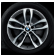
19" Double-spoke 424