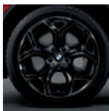
20" Y-spoke style 214 – Black