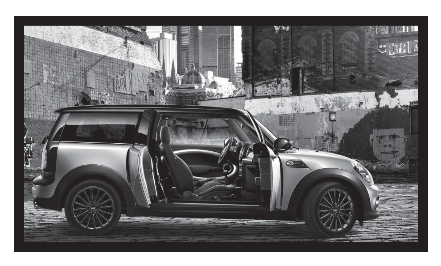
MINI CLUBMAN PRICE LIST. AUGUST 2010.